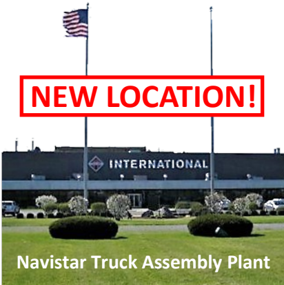
Navistar Truck Assembly Plant